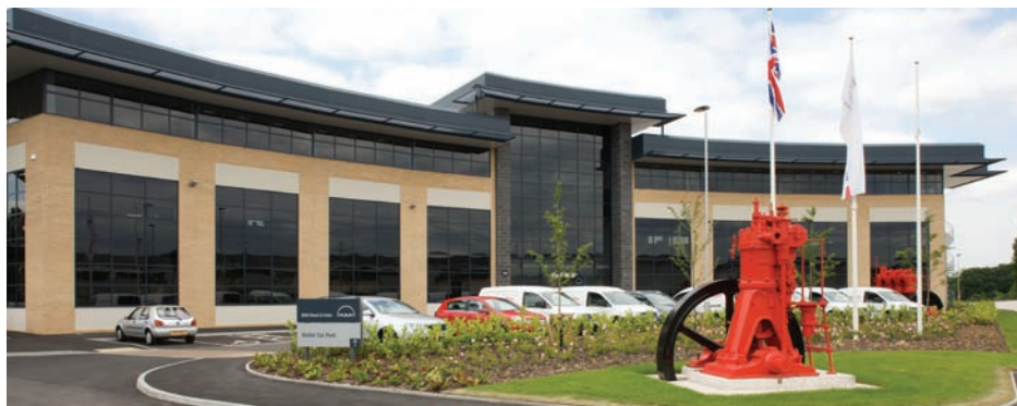
MAN Diesel & Turbo UK headquarters – Stockport

For more information contact us today on +44 (0)161 483 1000, email primeserv-uk@mandieselturbo.com or visit www.mandieselturbo.co.uk